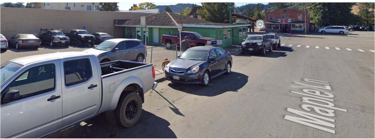
-End of Addendum No.2-