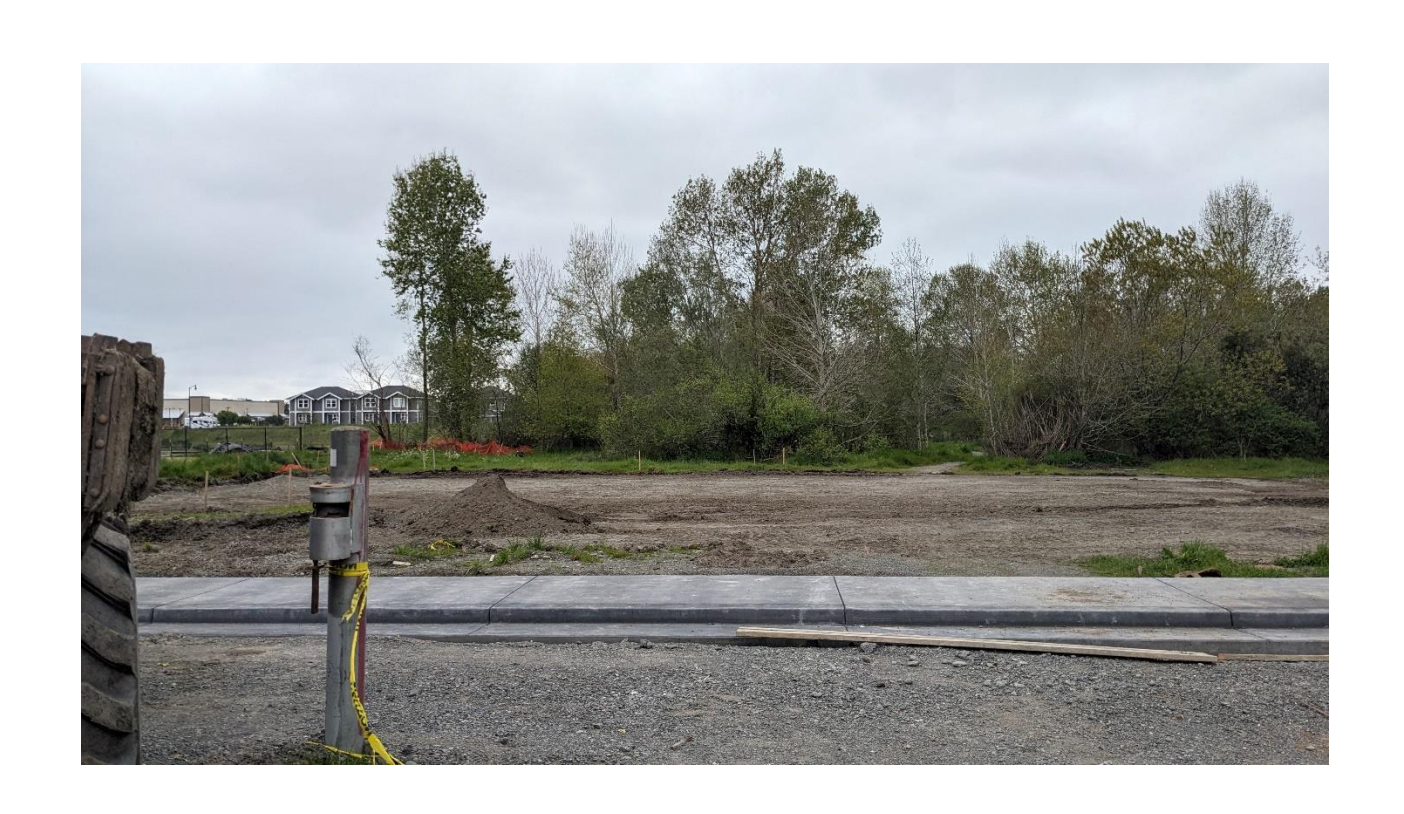
SITE #5 SEQUOIA PARK, EUREKA