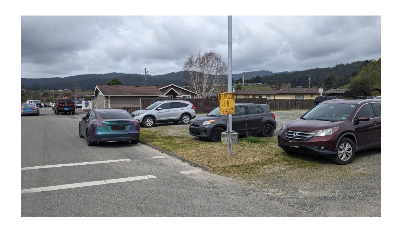
SITE #9 REDWOOD RURAL HEALTH CENTER