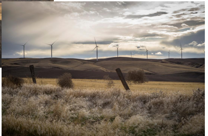
Tucannon River Wind Farm near Walla Walla, WA