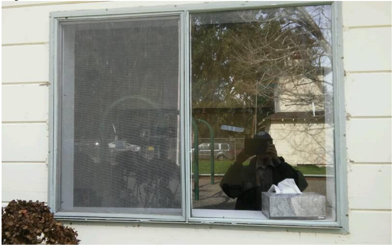
Image 2. Horizontal Slider