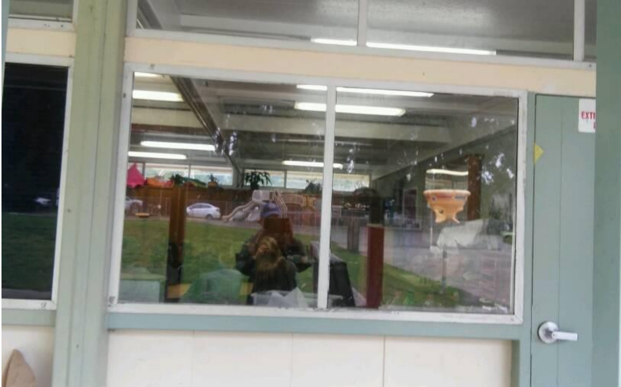
Image 4. Hopper Window